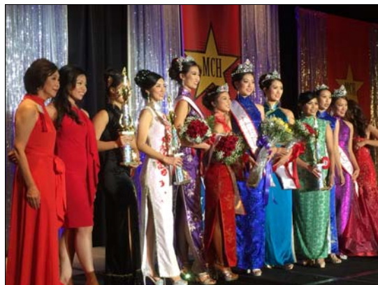
The 2016 Miss Chinatown Houston Scholarship Pageant held July 4, 2016.