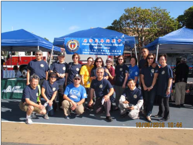
Members of Oakland Lodge engaged the Chinatown community at the Annual Health and Safety Awareness Fair, October 8.