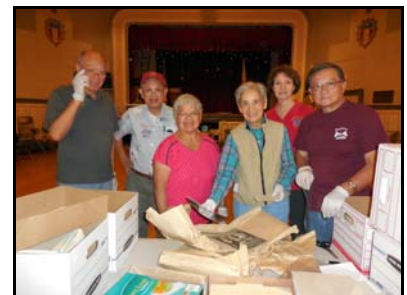
C.A.C.A. historical documents prepared for new home at Stanford University. See Page 7.