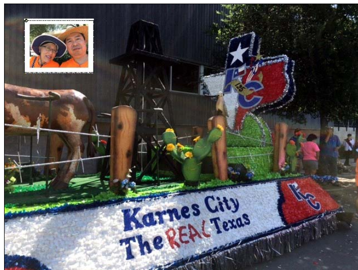
A float at the Fiesta Flambeau parade in San Antonio. The local Lodge assisted with safety inspections of the floats.