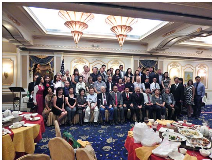
The L.A. Lodge Anniversary event was attended by C.A.C.A. National officers, elected officials, Chinatown organizations, and members of GSGV Lodge.